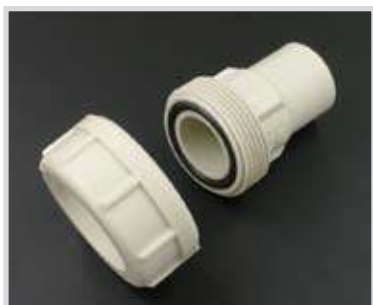
Plastic tube fitting systems

Plastic tube fitting system, suitable for Type KAS-70- or KAS-80-26-A-PTFE-PFS1-Y5