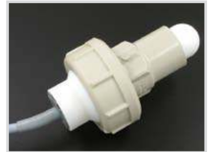
PP union nut da 32 / 1 1/2" Article No. 196 361

Plastic tube fitting system, suitable for Type KAS-70- or KAS-80-26-A-PTFE-PFS2