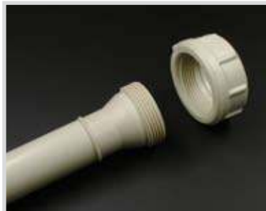
Plastic tube fitting systems

Stainless steel welding nipple, suitable for all our capacitive sensors KAS-70- or KAS-80-26-A-PTFE-Tri, KAS-70 or KAS-80-26-A-PTFE-Tri-100°C