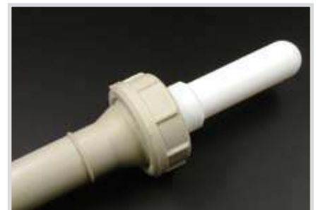
O-ring EPDM, suitable for union nut da 32 Article No. 196 362

Plastic tube fitting system, suitable for Type KAS-70- or KAS-80-26-A-PTFE-PFS1-Y5