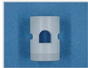
Holder for Sensor M18 - tube D.6.5, Nylon