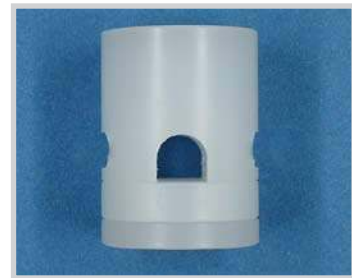
Holder for Sensor M30 - tube D 5.0, Nylon