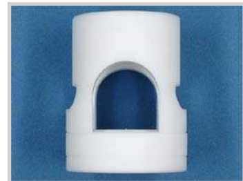
Holder for Sensor M30 - tube 3/4", PTFE