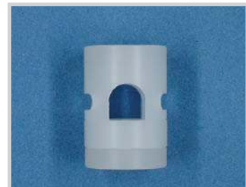
Holder for Sensor M18 - tube D.6.5, Nylon