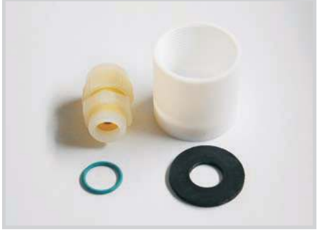
Protection Set M18 Art.-No. 196305 Protection Set M30 Art.-No. 196302 Protection Set M32 Art.-No. 196301